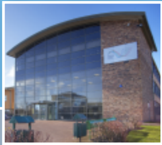
Knowsley Community College Kirkby Centre, Cherryfield Drive, Kirkby, Merseyside, L32 8SF